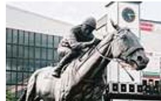
The Curragh

It has been 19 years since Meon Valley Stud's epoch-shaping Colorspin (Fr) carried the famous black-and-white silks of Helena Springfield Ltd to success in the G1 Irish Oaks, but the wheel will turn full circle if Dash to the Top (GB) (Montjeu {Ire}) justifies favoritism in today's Darley-sponsored renewal of the Classic at The Curragh.