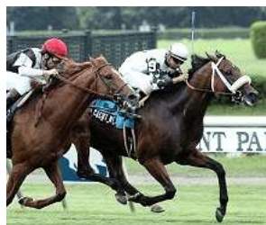
Cacht Wells