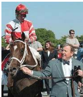
Round Pond