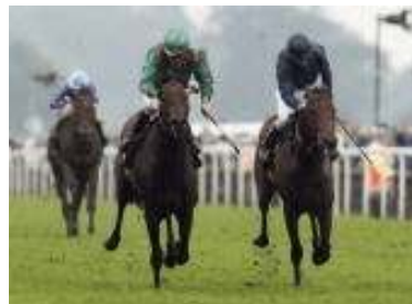
Azamour (left) defeats Ace at York

His Highness the Aga Khan's Azamour (Ire) (Night Shift) faces the age-old question of "will he stay" as he stretches out to a mile-and-a-half trip for the first time in today's G1 King George VI and Queen Elizabeth Diamond S. at Newbury. While there is no doubting the four-year-old's resolve, he will be entering unknown territory as he passes the quarter pole in today's feature, transferred from its native Ascot for the first time. He proved adept over that track's stiff mile when capturing the G1 St James's Palace S. last June and beat the best around over 10 furlongs when following up in the G1 Irish Champion S. at Leopardstown in September. He had excuses for his third in the G1 Champion S. at Newmarket the following month and fourth in the May 22 G1