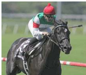
Cesario

CESARIO INJURED According to a statement from the Japan Racing Association, Carrot Farm's Cesario (Jpn) (Special Week {Jpn}), the winner of the Japanese Oaks and the GI American Oaks, has strained a ligament in her right front leg and will be sidelined for at least three months. The three-year-old became the first Japanese-bred to win a Grade I race in the U.S. when she took the American Oaks at Hollywood Park July 3, and was the first