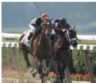
Smuggler (outside)