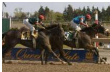
Wild Desert