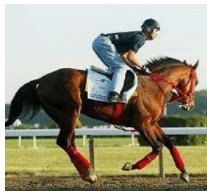
Ablet Alex

AFLEET ALEX TOPS HASKELL WEIGHTS The weights for the $1 million GI Haskell Invitational H., set for Sunday, Aug. 7, were announced yesterday. GI