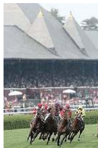
Racing at the Spa

August is just around the corner, and that can only mean one thing. Racing at the Spa. Saratoga Race Course, in Saratoga Springs, New York, kicks off its 36-day meet this afternoon with what promises to be an action-packed stand. On offer are 45 stakes races, 30 of which are graded and 13 of which are Grade-I events. Total stakes purses will exceed $10 million. The opening day feature is the 89 th running of the GII Adirondack S. for two-year-old fillies. Both Adieu (El Corredor), winner of the July 3 Astoria S., and Fifth Avenue (Monarchos), heroine of the June 9 Fashion