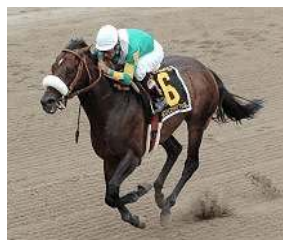
Pico Central