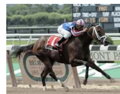
Adieu