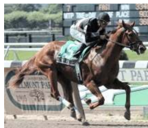
Henny Hughes