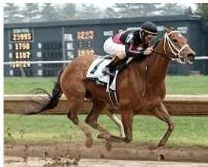
Madcap Escapade