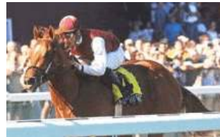
Henny Hughes