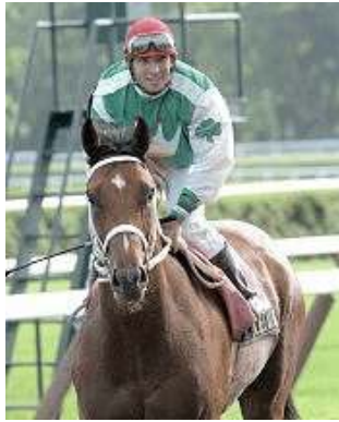
Afleet Alex

Cash Is King's Afleet Alex (Northern Afleet) has been injured and will miss the Aug. 7 GI Haskell Invitational H. at Monmouth Park, but he is expected to return to the races this fall. The GI Preakness and GI Belmont S. winner suffered a condylar fracture of the left front cannon bone and underwent surgery Wednesday.