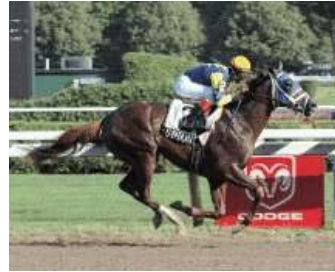
Flower Alley