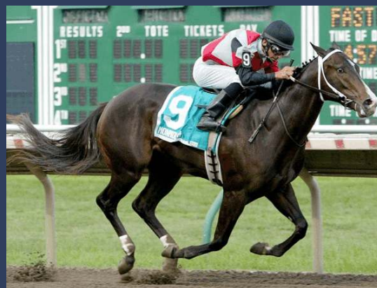
He's Got Grit - click here to view race video click here to view race chart