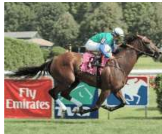
Sand Springs

The Sangster Family's Sand Springs (Dynaformer) was allowed to dictate moderate fractions on the front end and charged home a convincing winner of yesterday's GI Diana S. at Saratoga. "Once I found there was no speed, I was just going to get her out there and relax her," said winning jockey John Velazquez. "The only concern was the distance, and she proved she could handle that, but I also thought the slow pace helped her here, too." It was the first Grade I victory for the five-year-old, a $625,000 graduate of last year's Keeneland November Breeding Stock Sale. Cont. p2