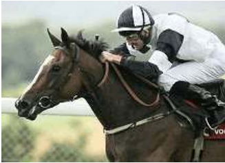
Alexander Goldrun