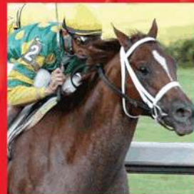
Eaton Saratoga Graduate