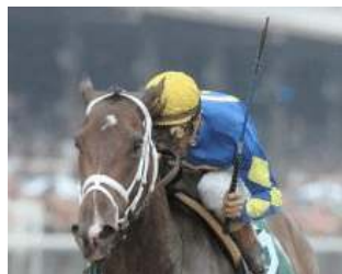
Ashado

After last year's Breeders' Cup Distaff winner Ashado (Saint Ballado) opened her four-year-old campaign with back-to-back defeats, there were whispers that the