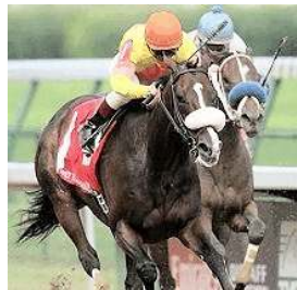
Day aboard Two Trail Sioux

Hall of Fame rider Pat Day officially announced his retirement from the saddle yesterday at Churchill Downs. The veteran reinsman retires as the all-time leader in career earnings with $297,912,019 and is currently ranked fourth on the victories list with 8,803 wins. He has seen limited action this year after undergoing hip surgery in March. "The major factor was just a loss of enthusiasm," Day explained yesterday. "In early March we discovered the problem with my hip and it was correctable and that kind of pumped new blood in me. Then there was the challenge to get through the operation and rehab and it was followed by the challenge to get back to