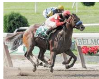
Roman Ruler winning the GII Dwyer S.