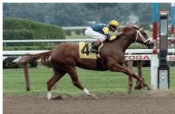
Indian Vale

Todd Pletcher may have a second runner for the Aug. 20 GI Alabama S. after Indian Vale (A.P. Indy)