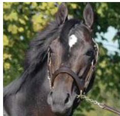
Champion Orientate Dual G1 Winner

© Copyright Thoroughbred Daily News. This newspaper may not be reproduced in any form or by any means, electronic or mechanical, without prior written permission of the copyright owner, MediaVista. Information as to the American races, race results and earnings was obtained from results charts published in Daily Racing Form and utilized here with with the permission of the copyright owner, Daily Racing Form.