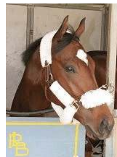
Sense of Style