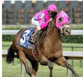
Saint Liam

Is Saint Liam (Saint Ballado) the leader of the pack? He can prove it with a win in today's GI Whitney S. at