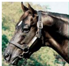
Mr. Greeley Sire of Sires