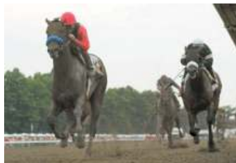
Roman Ruler guts out the win over Sun King

He came to the shore in search of his first Grade I victory and, just as Point Given and War Emblem had before him, wound up providing trainer Bob Baffert with an impressive victory in Monmouth Park's centerpiece, the GI Haskell Invitational H. Roman Ruler (Fusaichi