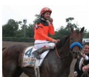
Bailey and Roman Ruler

Confidently ridden by Jerry Bailey, who was aboard for his Dwyer victory, Roman Ruler was coaxed back off the leaders as Sun King was sent out to lead the way through :23 2/5 and :47 3/5 splits.