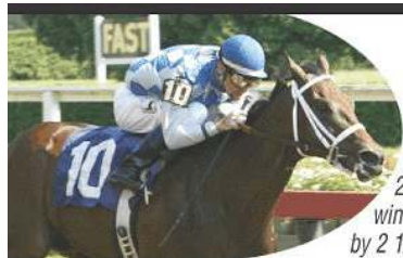
2yo LILLIANS CHOICE wins the Tah Dah S. by 2 1/2 lengths on 7/31.

You can also pick up a copy of the TDN today at the Fasig-Tipton Saratoga Selected Yearlings Sale.