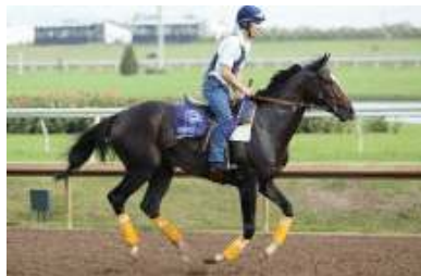
Whipper at Lone Star Park last October