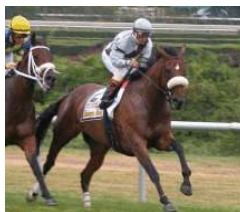
Love Match