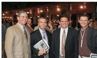
Team Taylor Made