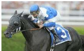
Better Talk Now