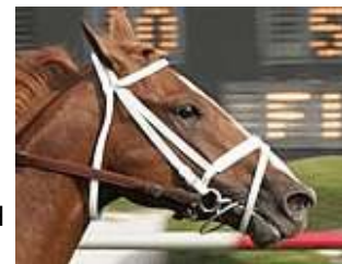
English Channel

English Channel fought on gamely, but was no match for the winner and had his winning streak stopped at four. "Being on the inside, he was pretty aggressive and he never really got off the bridle," John Velazquez said. "It's hard to get them to relax when they have to go the whole time. Everybody wanted to go at the same time and he got to throwing his head around and I never could get him to relax." Chattahoochee War , who followed English Channel home when second in the Virginia Derby, chased him once again yesterday, finishing a well-beaten third. "He picked it up nicely the last part, but I was a little too far back early on," jockey Pat Valenzuela said. "The speed never really stopped like it did the last two races when it stopped completely. We thought we were doing the smart thing by taking him back. I thought it was a little soft at first, but he seemed to handle the going just fine."