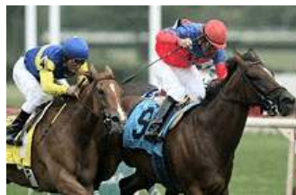
Angara Beats Megahertz Benoit