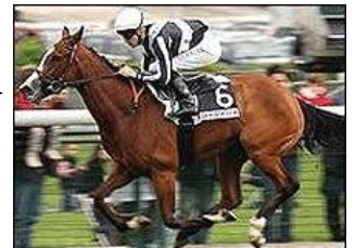
Divine Proportions