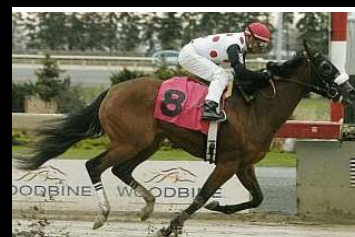
LEMON MAID , see video