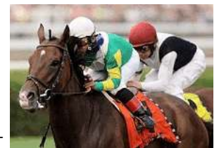
King's Drama