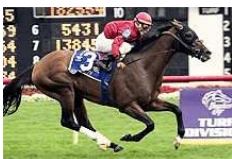
Gun Salute