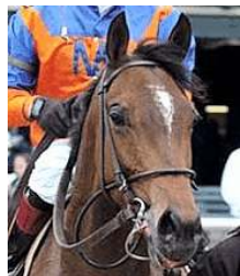
Angara