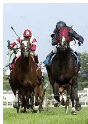
Powerscourt (right) beats Kitten's Joy

The second choice behind Kitten's Joy as he made another assault on Arlington's showpiece, Powerscourt was rated off the pace as first Whilly (Ire) (Sri Pekan)