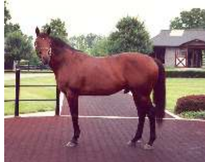
Real Quiet at Taylor Made

Real Quiet (Quiet American--Really Blue, by Believe It), the champion three-year-old colt in 1998 after his victories in the GI Kentucky Derby and GI Preakness S., is being relocated to Regal Heir Farms in Pennsylvania for the 2006 breeding season.