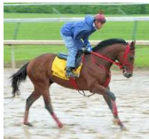
Afleet Alex