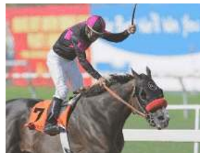
Lava Man