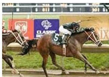
R Lady Joy