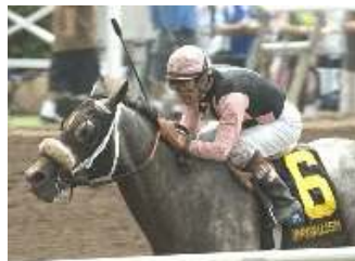
Imperialism

The handsome grey had not had his picture taken in over a year, but found a good time to become reacquainted with the inside of the winner's circle when he wore down early pacesetter Beau Soleil and outgamed game closer Gotaghostofachance to secure the win. Thrust squarley into the Classics spotlight with victories in last year's GII San Vicente S. and GII San Rafael S., the grey finished third, but was promoted to second, in the GI Santa Anita Derby before employing his customary come-from-behind tactics to collect show money in the GI Kentucky Derby. Generally a model of consistency, the colt failed to hit the board in three subsequent graded stakes starts, but rounded out the season with a third on the grass in the 10-furlong GI Hollywood Derby. Returned to