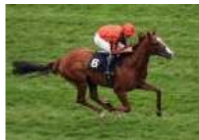
Silca's Sister