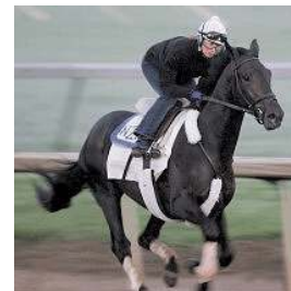
Bellamy Road