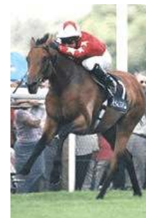
Rock of Gibraltar, sire of the topper