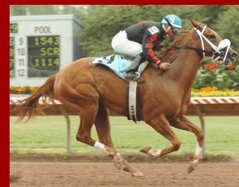
LITTLE MISS ZIP