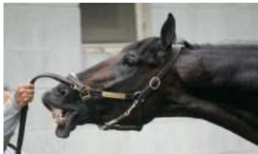
Bellamy Road