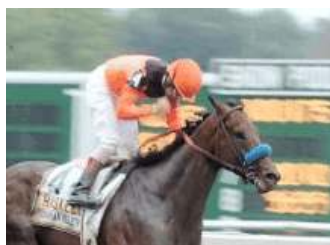
Roman Ruler

Roman Ruler (Fusaichi Pegasus), who returned from a 3 1/2-month absence to win the 8 1/2-furlong GII Dwyer S. in July. He proved he stayed nine furlongs with his victory in the GI Haskell Invitational H. Aug. 7 and retains the full confidence of his jockey as he tries the mile and a quarter for the first time. "The progression from the mile and a sixteenth to a mile and an eighth proves he is capable of [getting the distance]," said Jerry Bailey, looking for his fourth Travers. Field p3