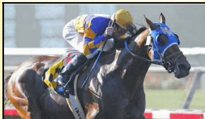
KELA wins the 2004 GII Pat O'Brien H. at Del Mar by 4 1/2 lengths

Won from 6f to 1 1/16 miles Earned Beyer Figures of 100 or more in 13 of 26 starts