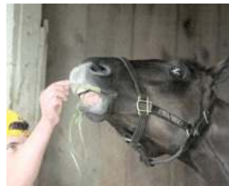
First Samurai

When Giant's Causeway was brought to Ashford Stud in Versailles, Kentucky after serving his initial season in Ireland at Coolmore, he offered breeders an intriguing puzzle. Was he a horse to use primarily with an eye to getting a European turf horse, or could it pay to try him with mares likely to produce dirt runners? He had, of course, proved himself at the highest level on both surfaces. Europeans came to know him as "the Iron Horse" after he captured five successive