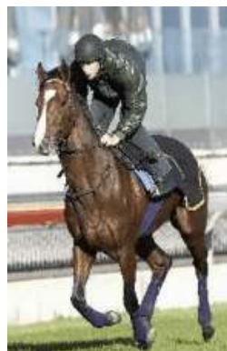
Phoenix Reach