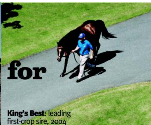
King's Best: leading first-crop sire, 2004