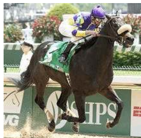
Battle Won