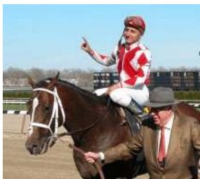
Forest Danger