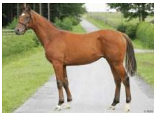
Hip 98

BADEN-BADEN BEGINS Europe's yearling sale season swings to Germany today as BBAG host their Baden-Baden Yearling Sale, extended to two days for the first time this year. Among the alumni from 2003