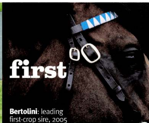
Bertolini: leading first-crop sire, 2005