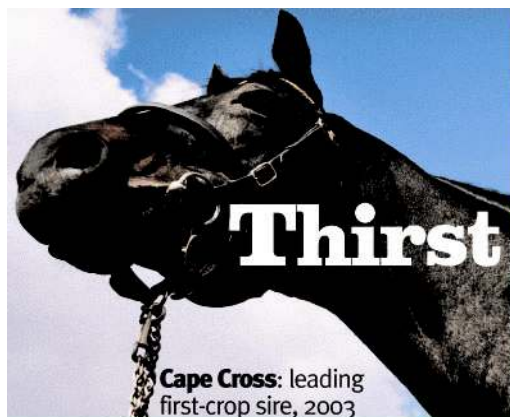
Cape Cross: leading first-crop sire, 2003

1st-DMR (MSW) Dancing General (General Meeting) flies home to 10-length win.