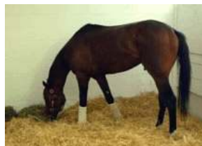
Oratory