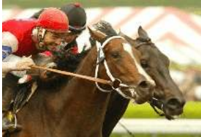
Castledale defeating Rock Hard Ten in the Santa Anita Derby