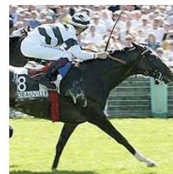
Whipper