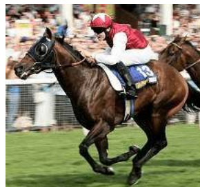
Goodricke