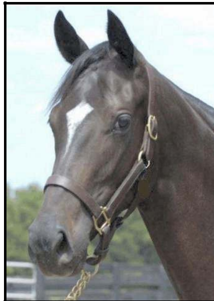
Keeneland September • Hip 205 Filly by Kingmambo – Escena