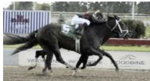
One for Rose (outside)

One for Rose, who earned Canada's champion older mare honors for the second year in a row in 2004,