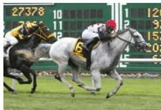
Revved Up

Three-for-four this year, Revved Up bids for his third straight stakes win after taking the June 11 Battlefield S. at Monmouth Park and the