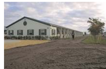
Palm Meadows