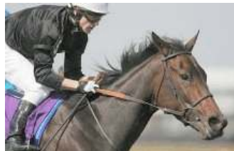
Ouija Board