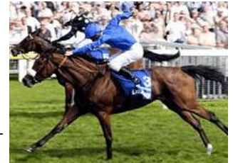
Punctilious