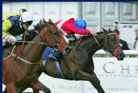
"NASHEEJ enters the Guineas & Oaks picture..."

Purses for Canadian races are in Canadian dollars.