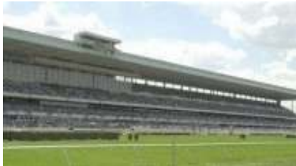
Belmont Park

Racing returns to Belmont Park this afternoon and, with the Breeders' Cup World Thoroughbred Championships just 50 days down the pipeline at the Long Island oval, little time will be wasted in showcasing several horses who could make an appearance on horse racing's 14 million-dollar day. Tomorrow's program features a quartet of Grade I events and rabbits figure to play a role in both the Woodward S. and the Man o' War S. Saint Liam (Saint Ballado) will be looking to even the