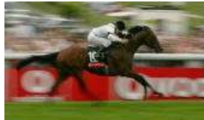
Motivator

Leopardstown may get its keenly anticipated clash between His Highness the Aga Khan's Azamour (Ire) (Night Shift) and Motivator (GB) (Montjeu {Ire}) in tomorrow's G1 Irish Champion S. after the forecast of heavy rain persuaded connections of the G1 Epsom Derby winner to declare yesterday. Off the track since running second in the July 2 G1 Eclipse S. on fast ground, the participation of the Royal Ascot Racing Club's Motiva-