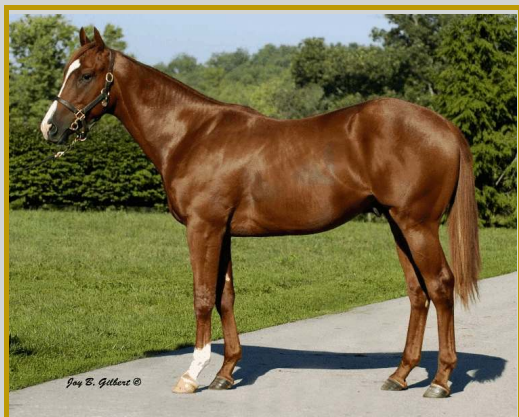
Hip 3654 Colt by Menifee-Freddie Frisson ½ Brother to FIRST SAMURAI -1st in Gr1 Hopeful Stakes at Saratoga on 8/27/05