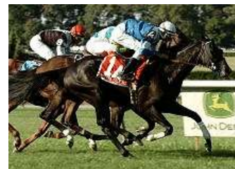
Better Talk Now