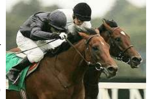
Oratorio (outside) beats Motivator