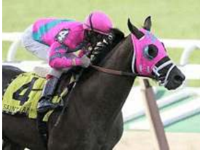
Saint Liam