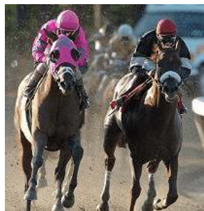
Saint Liam (left) forges past Commentator Adam Coglianesse

Saint Liam came to life at the end of his three-year-old campaign, winning an Aqueduct allowance test in December of 2003. He opened 2004 with a victory over optional claimers at Gulfstream in January, then was beaten just a head by Peace Rules when second in the Feb. 29 GII New Orleans H. The bay was sidelined after finishing third behind that rival in the Apr. 3 GII Oaklawn H., but came back to run the race of his life when second, beaten just a neck by Horse of the Year Ghostzapper at level weights, in this race last year.