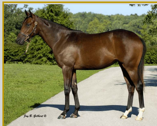
Hip 2871 Filly by Mr. Greeley-Heat Lightning ½ Sister to STEVIE WONDERBOY -1st in Gr2 Del Mar Futurity on 9/7/05