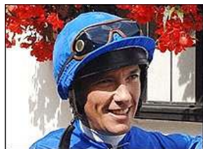
Frankie Dettori

Scorpion made his debut on testing ground at Leopardstown May 8, winning by a measured half length as the odds-on choice, and was narrowly denied an instant stakes score two weeks later when on the wrong side of the photo in the G3 Gallinule S. at The Curragh. The combination of fast ground and a slow pace was his undoing when trailing in the June 5 G1 Prix du Jockey-Club (French Derby) at Chantilly, but he