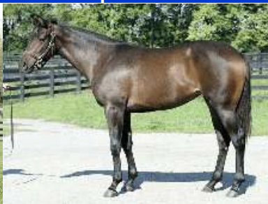
HIP 3302 Filly by More Than Ready