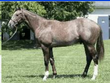
HIP 3786 Colt by Holy Bull