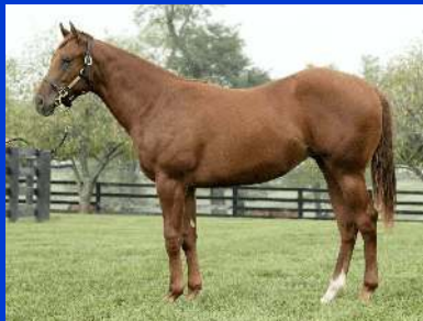
HIP 2242 Colt by Maria's Mon

Here are just a few of the horses not to miss: