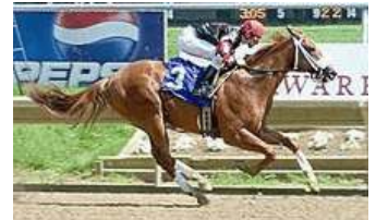
Master of Disaster Hoofprints