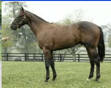
HIP 4719 Colt by Grindstone