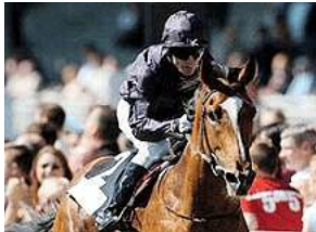
George Washington

George Washington (Ire) (Danehill) was only given the green light to run in yesterday's G1 Laing O'Rourke National S. at The Curragh after a blood sample, taken Saturday, pleased trainer Aidan O'Brien. However, the decision to run him, instead of stablemate Horatio Nelson (Ire) (Danehill), proved the right one when the bay colt overcame a stumbling start to beat Golden Arrow (Ire) (Danehill) by a decisive two lengths, cementing his position at the head of the betting for the 2006 G1 2000 Guineas at Newmarket. "When he stumbled, he had a lot of ground to make up," trainer Aidan O'Brien told Racing Post , adding, "He got the seven furlongs no problem and it was very easy for him." Cont. p2