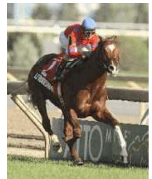
Leroidesanimaux

Leroidesanimaux (Brz) (Candy Stripes) turned in another dominating performance to take yesterday's GI Atto Mile at Woodbine and extend his win streak to eight. The handsome chestnut, already victorious in last year's GI Citation H. and this season's GI Frank E. Kilroe Mile and GI Fourstardave H., was sent off the 6-5 favorite yesterday and never gave his fans an anxious moment. He opened a clear lead on the turn and accelerated away when asked in upper stretch, sailing home a 7 3/4-length winner over a yielding turf course. "He has to rank up there with the better horses I have ever trained," said winning trainer Bobby Frankel. "He never gets beat. So when you have a horse like that, you have to consider him one of the best you have ever trained." Cont. p2 Click for brisnet.com chart or brisnet.com catalogue-style pedigree. Video, sponsored by Taylor Made.