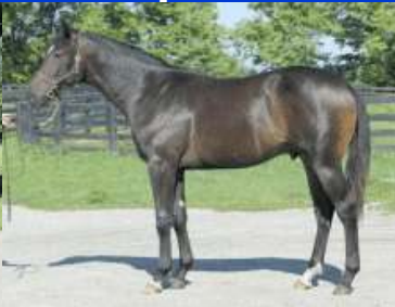
HIP 4097 Colt by Deputy Commander