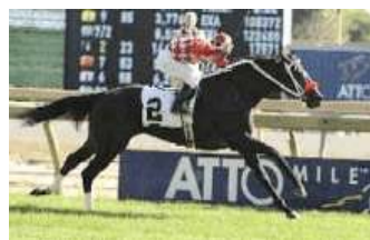
Classic Stamp

Classic Stamp, winless since taking this race last year, was second in the July 16 Gill Dance Smartly H. before venturing south of the border for a sixth-place effort in the Aug. 7 Gill Matchmaker S. at Monmouth.