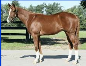
HIP 3319 Colt by Stravinsky

Here are just a few of the horses not to miss: