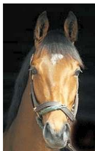
Perfect Drift