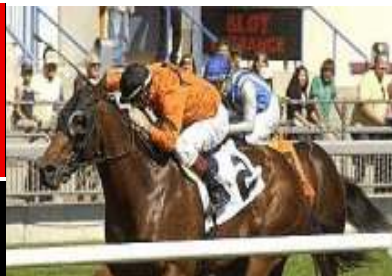
BEAR'S KID wins G2 Summer S.

Didn't we just mention recently it's getting hard to keep up with his winners and stakes horses?! Sept. 21 - WINNING SEASON - SW takes allowance by 7 Sept. 18 - BEAR'S KID - WINS Grade 2 Summer S. Sept. 17 - KID LEMONADE - 2ND Whirling Ash S. Sept. 17 - MENACING - WON at first asking by 5 1/4 Sept. 13 - BASEMAH (FR) - WIN #2 in France Sept. 11 - BE ENVIED - WON second start