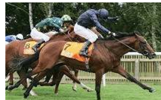
Ivan Denisovich

(Danehill) in today's G1 Shadwell Stud Middle Park S. at Newmarket. Stablemate Art Museum (Storm Cat) was entered as well, but his participation is now in doubt. "We are struggling a bit with Art Museum ," O'Brien said. "He had a stone bruise and we will see how he is--he's not a certain runner." Ivan Denisovich is more than capable of flying the Ballydoyle flag on his own. Like the stable's past winners Minardi and Johannesburg , the colt carries group-winning form into the race, having collected the G2 July S. July 6.