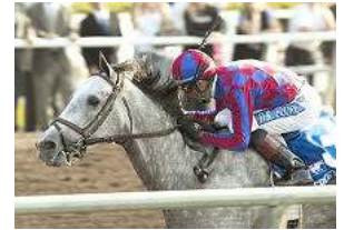
Greg's Gold