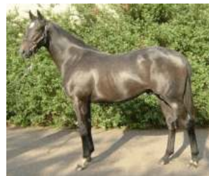
Hip 360 at Tattersalls