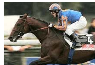
Hurricane Run

Today's G1 Prix de l'Arc de Triomphe at Longchamp has drawn the winners of 23 Group 1 races, including the English, Irish and German Derbies, St Leger, Irish Oaks, Coronation Cup and Grosser Preis von Baden, as well as the best stayer around and a defending champion. But, despite its depth every year, the Arc tends to conform to the same formula. In Michael Tabor's Hurricane Run (Ire) (Montjeu {Ire}), this year's field has the textbook favorite. Since 1991, three-year-old colts have dominated, playing second fiddle to their elders only four times. Suave Dancer, Peintre Celebre, Montjeu (Ire), Sinnidar (Ire) and Dalakhani (Ire) all fit the pattern as Derby winners who returned from a summer break ready to explode in the fall. Hurricane Run has history on his side, having won the June 26 G1 Irish Derby at The Curragh before a smooth prep in the course-and-distance G2 Prix Niel Sept. 11, a race used by eight of the last 11 winners. He is also in the hands of a five-time Arc winning conditioner in Andre Fabre and has the assistance of Kieren Fallon in the saddle. "I've got a very good horse and am drawn well in six, which is very important," Fallon said. "I think it's a competitive race this year and there are lots of horses with chances, but he'd got the best one." Arc cont. p14