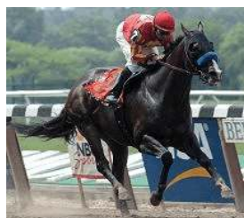
Woke Up Dreamin