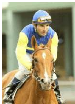
Megahertz