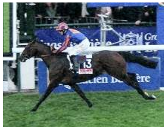
Hurricane Run france-galop.com