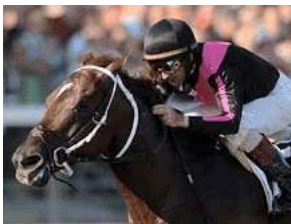
First Samurai

First Samurai (Giant's Causeway) looks to remain perfect in the GI Champagne S. at Belmont after easily defeating Henny Hughes (Hennessy) and Too Much