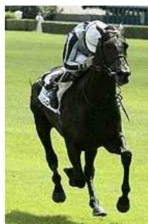
Bago

BAGO TO STAND IN JAPAN The Niarchos' Family's Bago (Fr) (Nashwan--Moonlight's Box, by Nureyev), highweight two-year-old in France in 2003 and champion three-year-old in Europe in 2004, will begin his