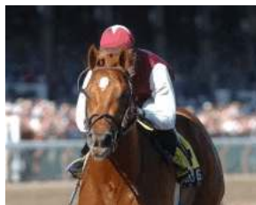
Henny Hughes