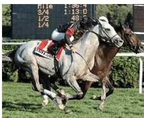
Saranac

Canadian-based Jambalaya showed he could handle conditions south of the border with alacrity, maintaining his unbeaten turf record with a game win in the GIII