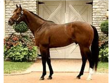
Yes It's True www.threechimneys.com