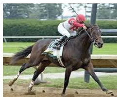
Dawn of War

At Belmont, in the GI Champagne S., Giant's Causeway's son First Samurai strengthened his position as the leader of the juvenile pack, this time with another