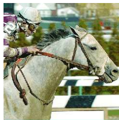
TAPIT winner of the Wood Memorial S.-G1