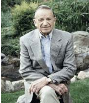
Richard Stone Reeves 1919 - 2005

Renowned equine artist Richard Stone Reeves died Friday, Oct. 7, at Eastern Long Island Hospital in Greenport, NY, reports The Blood-Horse . He was 85. Born in New York City in 1919, Reeves was a Syracuse University graduate who served in the U.S. Navy during World War II. He quickly gained prominence following the war and, through the next half century, is reputed to have painted more international champions that any artist in history. A favorite of H.H. Prince Aga Khan's since he was commissioned to portray the