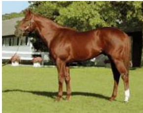
Covering Sire Speightstown winstarfarm.com

Enduring Legacy, a Saint Ballado half sister to the ill-fated Grade I stakes winner Star Over the Bay (Cozzene), topped the second day of bidding at the OBS Fall Mixed Sale in Ocala yesterday. Selling as hip 343, the five-year-old mare was knocked down to Y-Lo Racing Stables for $215,000. She was part of the Four Horsemen's Ranch dispersal. Selling in foal to 2004 GI Breeders' Cup Sprint