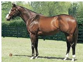
Songandaprayer