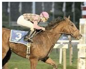
A Huevo (1996-2005)

A HUEVO EUTHANIZED The nine-year-old A Huevo (Cool Joe--Verabald, by Baldski) was euthanized Saturday night after sustaining an injury in his title defense of the West Virginia Breeders Classic at Charles Town Race Course.