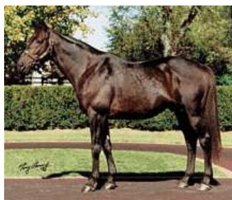
Dynaformer

Three Chimneys stallion Dynaformer became the newest stallion in the six-figure club when his fee was raised to $100,000 for the 2006 season. The 20-year-old son of Roberto, who currently is second on the North American general sire list with $6,505,188 in worldwide earnings this year, stood for $75,000 in 2005. Dynaformer's leading earner in 2005 is G1 Dubai World Cup runner-up Dynever, who has banked $1,220,000 this term. Dynaformer becomes