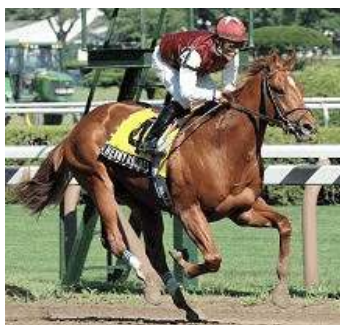
Henny Hughes at Saratoga