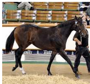
Hip 864 - Kyllachy filly www.tattersalls.com

Yesterday's opening session of Part 2 of Tattersalls' October Yearling Sale featured 11 six-figure lots, with a first-crop Kyllachy (GB) filly topping the session at