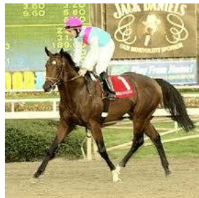
Special Rate