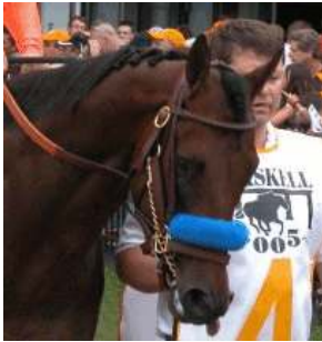
Roman Ruler

Roman Ruler (Fusaichi Pegasus) appears to be headed to the GI Breeders' Cup Sprint at Belmont Park Oct. 29 after turning in a sharp four furlong move in :47 at Santa Anita yesterday. "After watching him today I might be leaning towards the Sprint," trainer Bob Baffert commented. "He went very nice. This is the best he's gone in a long time. The way he worked today, the Breeders' Cup Sprint would probably be highly likely for him if he continues the way he's going. He's a quick horse. He's fast." The GI Haskell Invitational H. winner