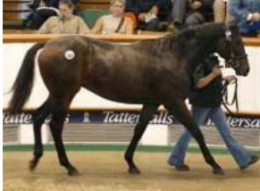
Lot 1099

RED RANSOM FILLY TOPS TATTS A Red Ransom filly bought in utero at Keeneland's 2004 January Sale recouped the $230,000 purchase price of her dam