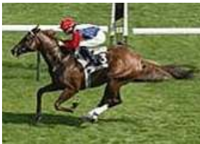
Starcraft