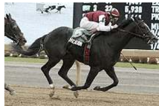
Unification at Woodbine

The appearance of three new graded stakes winners in the last two weeks for sophomore sire Dixie Union (Dixieland Band) has resulted in his 2006 stud fee being raised to $40,000 at Lane's End Farm. The eight-year-old's fee had previously been announced as $30,000. His three-year-old daughter Nothing But Fun won the GII Cotillion H. Oct. 1, two-year-old filly Sensation captured the GIII Astarita S. Oct. 2 and two-year-old colt Unification landed the GIII Grey Breeders' Cup S. Oct. 10.