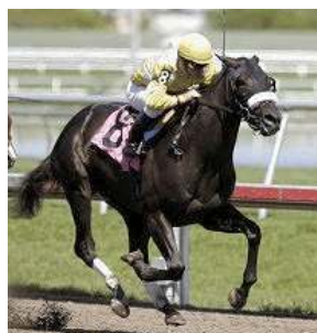
2005 SW Pinpoint, who will run in the GIII Perryville S. at Keeneland today.