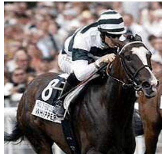
Whipper

Multiple Group 1 winner Whipper (Miesque's Son--Myth to Reality {Fr}, by Sadler's Wells), who is scheduled to make his final career start in the GI Breeders' Cup Mile at Belmont Park Oct. 29, will take up stallion duty at Ballylinch Stud in Co. Kilkenny, Ireland in 2006. His stud fee will be announced at a later date. The elder 3/4-brother to European champion filly Divine Proportions was France's highweighted three-year-old miler last year. He has won at the Group 1 level during all three seasons on the track--the Prix Morny at two, the Prix Jacques le Marois during his sophomore year and this term's Prix Maurice de Gheest.