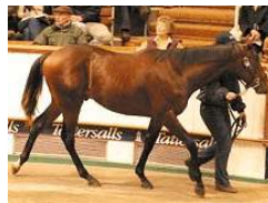
Lot 1314 - Sakhee colt www.tattersalls.com

SAKHEE COLT TOPS TATTS THURSDAY First-year Shadwell Stud stallion Sakhee dominated yesterday's trading at the Tattersalls October Yearling Sale