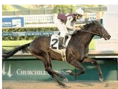
Four Footed Foto

The lone graded stakes winner here, Straight Line captured the GIII Iroquois S. going a mile at Churchill last fall, but was sidelined for much of the spring with a hock infection. After a pair of unplaced efforts going nine furlongs, he won when cutting back to seven panels in the Forward Pass S. at Arlington Aug. 13. He followed with a sixth in the Paradise Creek S. on the turf Sept. 17.