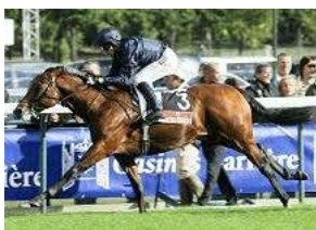
Horatio Nelson France Galop

Aidan O'Brien will delay the choice between representatives George Washington and Horatio Nelson after heavy rain fell before racing yesterday. The Ballydoyle conditioner confirmed that the former will run if the ground is good or faster, while Horatio Nelson will take his place if conditions remain on the soft side. Both colts are coming off big wins, George Washington in the G1 National S. at The Curragh and Horatio Nelson at Longchamp in the G1 Prix Jean Luc Lagardere.