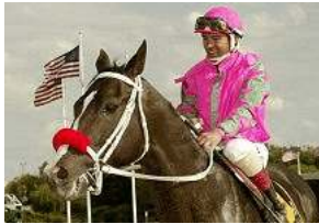
Lord of the Game

Multiple graded stakes winner Lord of the Game (Saint Ballado) breezed five-eighths in 1:02 at Hawthorne yesterday morning ahead of a possible start in the $4-million GI Breeders' Cup Classic at Belmont Oct. 29. "Our plan is to run in the Classic, and all we're waiting for now is to see if we get in," explained trainer Tom Tomillo. "If that happens, we'll get there 10 or 11 days away from the race and I'll get a work into him over the track." Claimed for $10,000 out of his winning debut, the four-year-old has won 8 of 12 career starts, including the GII Prairie Meadows Cornhusker Breeders' Cup H. and the GIII Hanshin Cup H. He most recently missed by a head in the 10-furlong GII Hawthorne Gold Cup Sept. 24.