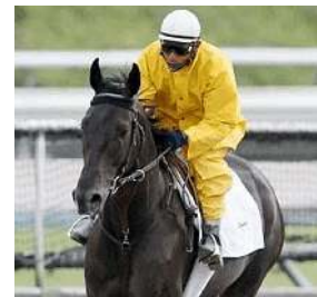
Rock Hard Ten