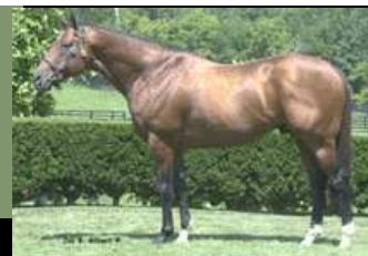
$10,000 Live Foal