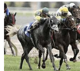
Honey Ryder

She hasn't done much wrong all year. Honey Ryder (Lasting Approval) ran her 2005 record to five-for-seven at Woodbine yesterday, putting in a strong late run that carried her to a half-length triumph over Lattice (Ire) (Inchiner {GB}) in the GI E.P. Taylor S. The four-year-old added the win to victories in the GIII The Very One H. and GII Orchid H. at Gulfstream over the winter, the R.G. Dick BC H. at Delaware Park in July and the Sept. 5 GIII Glens Falls H. at Saratoga last time out. E.P. Taylor cont. p2