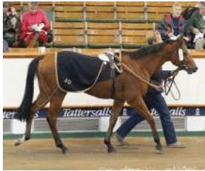
Lot 147 Tattersalls