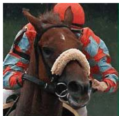
Smoke Glacken's 6th GSW SMOKUME Tom Fool H.-G2 at Belmont