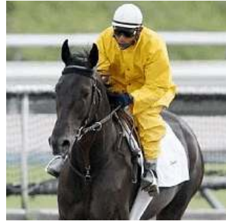
Rock Hard Ten