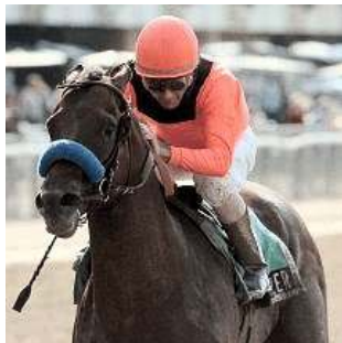
Roman Ruler