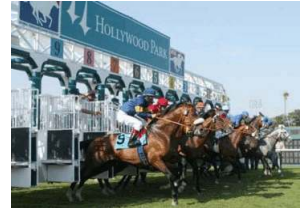
They're off at Hollywood