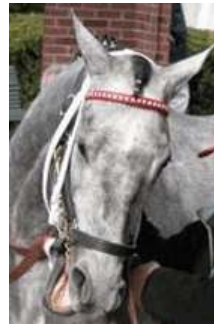
Wild Fit Sherackatthetrack