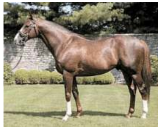
Giant's Causeway

Coolmore Stud announced the stud fees for some of its biggest names yesterday. Giant's Causeway , based at Coolmore's Ashford division in Kentucky and the sire of GISW First Samurai and European stars Footstepsinthesand (GB), Shamardal and Maids Causeway (Ire), has had his fee upped from $200,000 to $300,000. Coolmore also raised the fee for the Irish-based Montjeu (Ire) , who had a banner year in Europe this season with three Classic winners--Motivator (GB), Hurricane Run (Ire), and Scorpion (Ire)--from his first crop. The son of Sadler's Wells will stand for €125,000, or approximately $150,000, for 2006, up from €45,000 last term. Coolmore announced that the fee for Fusaichi Pegasus , sire of 2005 Grade I winners Bandini and Roman Ruler, would remain at $125,000.