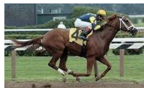
Indian Vale

Indian Vale certainly looked like the goods taking her first three starts by a combined 25 lengths, including a pair of Saratoga allowances, but disappointed in her first chance versus stakes company, finishing fifth in the Oct. 1 GII Cotillion H. at Philly Park with Hall of Famer Angel Cordero, Jr. aboard. "She didn't seem to handle the track at all that day," trainer Todd Pletcher said. "Angel said he knew he was in trouble when she was going into the first turn. She's come back in good shape and we're anxious to stretch her out to a mile and an eighth."