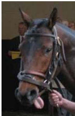
Badge of Silver Sherackatthetrack