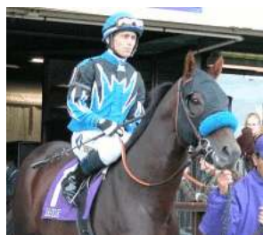
Taste of Paradise Sherackatthetrack

TASTE OF PARADISE RETIRED GI Vosburgh S. winner Taste of Paradise (Conquistador Cielo--Tastetheteardrops, by What Luck) has been retired due