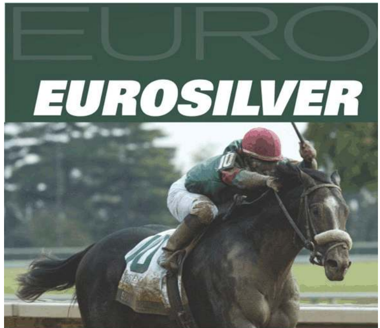
Brilliant 2YO by Unbridled's Song