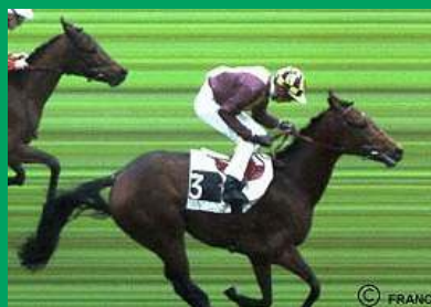
Gr1-Criterium de Saint Cloud

Don't miss the next opportunity to buy DEAUVILLE quality, the DEAUVILLE DECEMBER sale runs from December 3rd to 5th