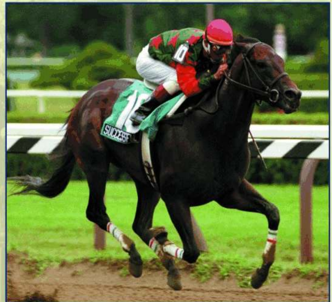
Grade II winner at 2, 3 and 4 with 119 Beyer Speed