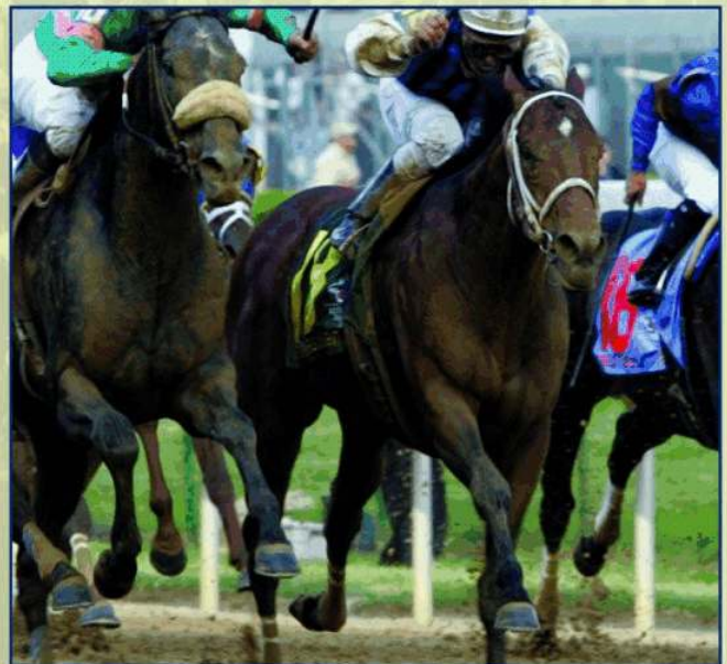
Graded Stakes Winner CLOSING ARGUMENT ($986,984) leading deep into the stretch of the 2005 Kentucky Derby-G1