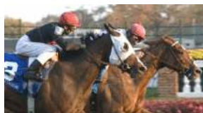
Four Footed Foto

She had to dig down deep to post her first graded stakes victory, but My Typhoon (Ire) (Giant's Causeway) was up to the task, posting a narrow victory over Isla Cozzene (Cozzene) in the GII Mrs. Revere S. at Churchill.