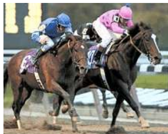
Tiznow winning the 2001 Breeders' Cup Classic

A weanling colt by Tiznow topped all bids Sunday during the seventh session of the Keeneland November Breeding Stock Sale in Lexington. Selling as hip 2538 ,