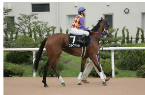
Sweep Tosho

What is interesting about this list of male-conquering Japanese fillies, from an American viewpoint, is that Sweep Tosho and Rhein Kraft are both daughters of