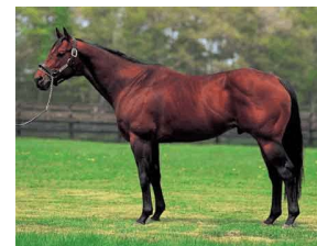
End Sweep

His premature death looks especially regrettable in view of his achievements. In North America he maintained his dominance to such an extent that he took the titles of leading second- and third-crop sire. His second crop was headed by the Grade I winners Trippi and Swept Overboard, with Precise End scoring at Grade III level, and his third produced Dark Ending, a Grade I winner in Canada.