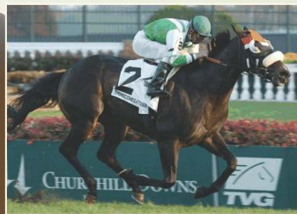
THERECOMESATIGER ($173,238 at 3, 2005) unleashed in the Commonwealth Turf at Churchill Sunday