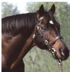
Deputy Minister, sire of session topper