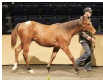
Hip 188 goffs.com

CAPTAIN RIO IN DEMAND Ballyhane Stud-based freshman sire Captain Rio (GB) (Pivotal {GB}) supplied the top-priced colt and filly during the first session of the Goffs November Sale yesterday, which saw a dramatic rise of nearly 36 percent in average. Topping the trading was hip 206 , a filly from the draft of Mount Pleasant Farm. Hailing from the Moyglare family of Simple Exchange (Ire), Sights on Gold (Ire) and Grey Swallow (Ire), she was purchased by