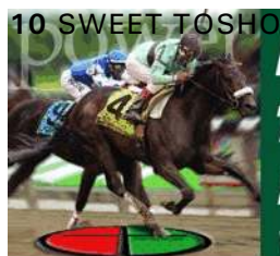
BIRDSTONE defeated SMARTY JONES in the Belmont S.-G1