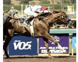
Diamond Omi

DIAMOND OMI DEAD GSW Diamond Omi (Giant's Causeway), who contracted a respiratory infection that developed into pneumonia after finishing 10th in the Oct. 29 GI Breeders' Cup Juvenile Fillies, was euthanized Thursday at Chino Valley Equine Clinic. "She fought so hard," trainer Bob Baffert told The Blood-Horse .