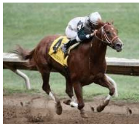
Elusive Jazz