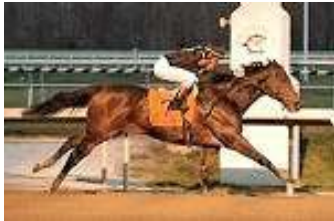
I'm The Tiger

Stronach Stables' I'm The Tiger (Siphon {Brz}) has always hinted at good things and yesterday it all came together, as the consistent five-year-old led past every