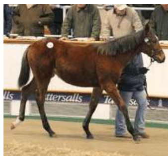
Hip 1048 Tattersalls