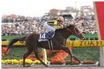
2004 winner Time Paradox