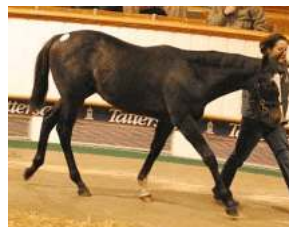
Lot 927 Tattersalls