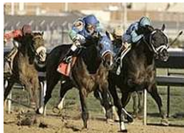
Magna Graduate (inside) gets the better of Suave Four-Footed Fotos

The big party for his classmates came a little over six months ago at this track, but for the late-developing Magna Graduate (Honor Grades), a gutsy victory over